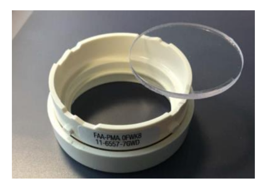
Figure 1. Defective Part from Customer – Lens Separated During Installation

1625 North 1100 West Springville, UT 84663 SERVICE INFORMATION LETTER